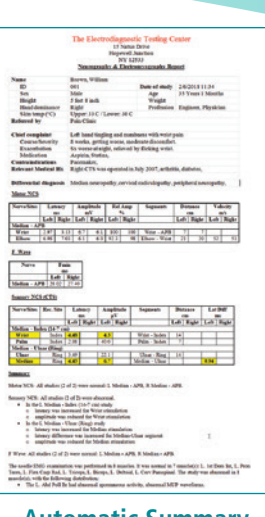
Automatic Summary Generation